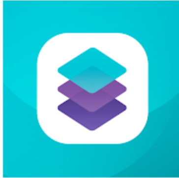
New app icon for SchoolsBuddy 2.0.

To access SchoolsBuddy you must first activate your account;